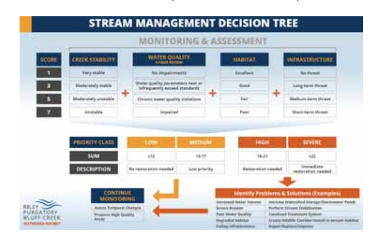
The creek management framework used in the CRAS is highlighted above and will be key to future District management efforts in this Plan. (see Section 9.1.2)

management approach to protecting and restoring the resources. The One Waters philosophy continues to be a key element to resource management and a component of the District's prioritization approach (see Section 4.0). The adaptive management philosophy is also carried forward into this plan and is instrumental in the District's lake and creek management approach (see Section 9.1.1 and Section 9.1.2).