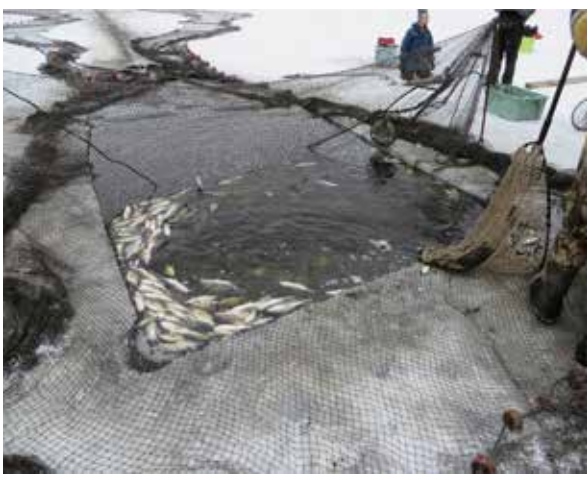
Commercial fishermen remove carp through winter seining.

The District hired its first full-time employee and opened its first office at Eden Prairie City Center. It hosted two "Evening with the Watershed" educational events for residents, staff, and elected officials, presenting updates on District activities and presentations on current and emerging topics and technologies. The Board of Water and Soil Resources awarded the District its first Clean Water Fund Grant. The grant called for the development of a costshare program targeting non-profits to