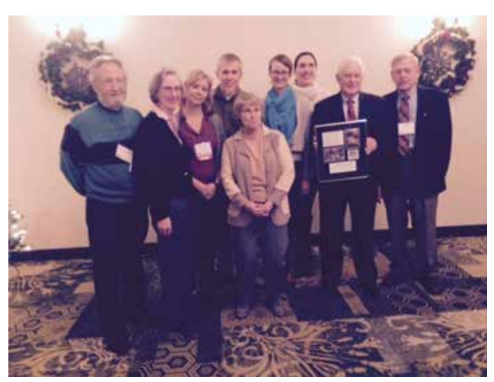
Riley-Purgatory-Bluff Creek Watershed District receiving Minnesota Association of Watershed District Program of the Year Award

Two District programs were finalists for the Minnesota Association of Watershed Districts (MAWD) Program of the Year Award: Adopt-A-Dock and the Creek Restoration Action Strategy (CRAS) programs. The CRAS won the award. The CRAS was a staff and engineer led effort to evaluate the overall health of the creeks and determine where sites in most need of restoration were located. The District was also awarded two Clean Water Legacy grants. The Clean Water Legacy