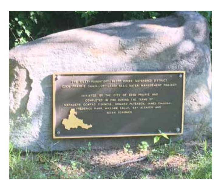
Plaque commemorating the completion of the Eden Prairie Chain-of-Lakes Basic Water Management Project