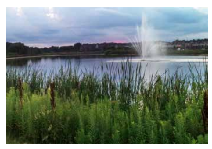
Purgatory Creek Park Area provides for control of flood waters, water quality improvement, recreation and wetland restoration.

1991: Petition received from the city of Eden Prairie for the Purgatory Creek Recreation Area project to provide for control of flood water, water quality improvement, wildlife recreation, and wetland restoration, while achieving the primary benefit of controlling the discharge of waters entering the Purgatory Creek valley. The project was delayed for several years while the City of Eden Prairie received easements or dedication of properties within and riparian to the project area. The