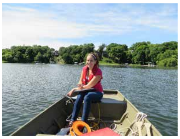
A volunteer helps staff collect water data.

The District moved its data-collection in-house by hiring two temporary staff to run the program. It also began the rulemaking process, developed a costshare program to implement projects that would help improve water quality, and revised the website. The District again hosted its semi-annual "Evening with the Watershed" educational events. In Spring of 2013, the Department of Natural Resources awarded the District two aquatic invasive species (AIS) grants